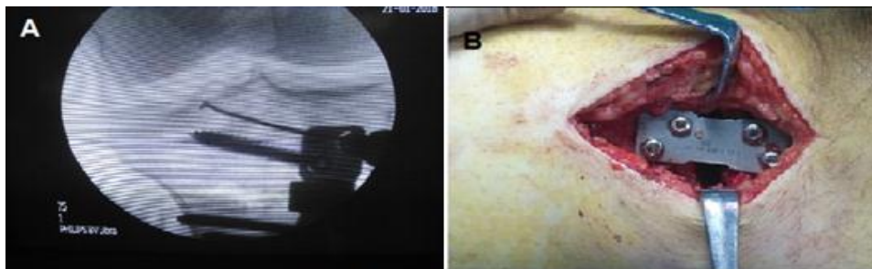
Fig (2) Plate positioning, with proximal and distal screws insertion.